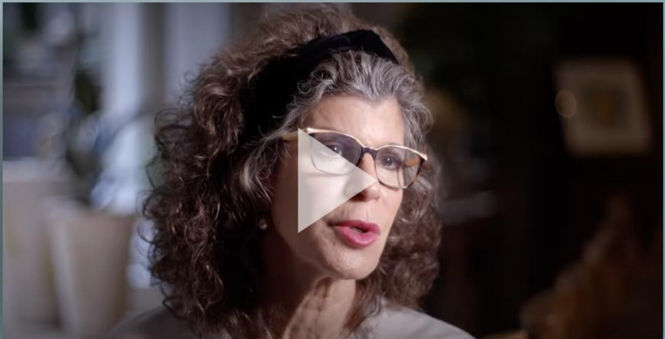
Documentary on Surveillance Capitalism